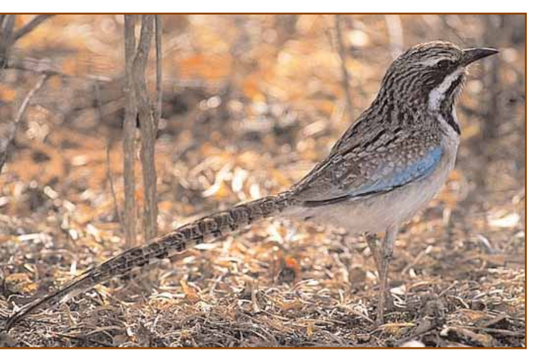
The Long-tailed Ground-Roller ( Uratelornis chimaera ) is only found in the "spiny forest" of southwest Madagascar. A guide named Musa, who had no shoes and spoke no English except for bird names, found this bird and all of the other local specialties of Ifaty in less than one day. Ifaty, Madagascar; July 1998.

areas and who do not benefit from ecotourism are likely to resent tourists and to resist conservation policies. In addition, visited areas can be contaminated by tourist waste, and habitat clearance can result from the construction of buildings and facilities (Weaver 1998).