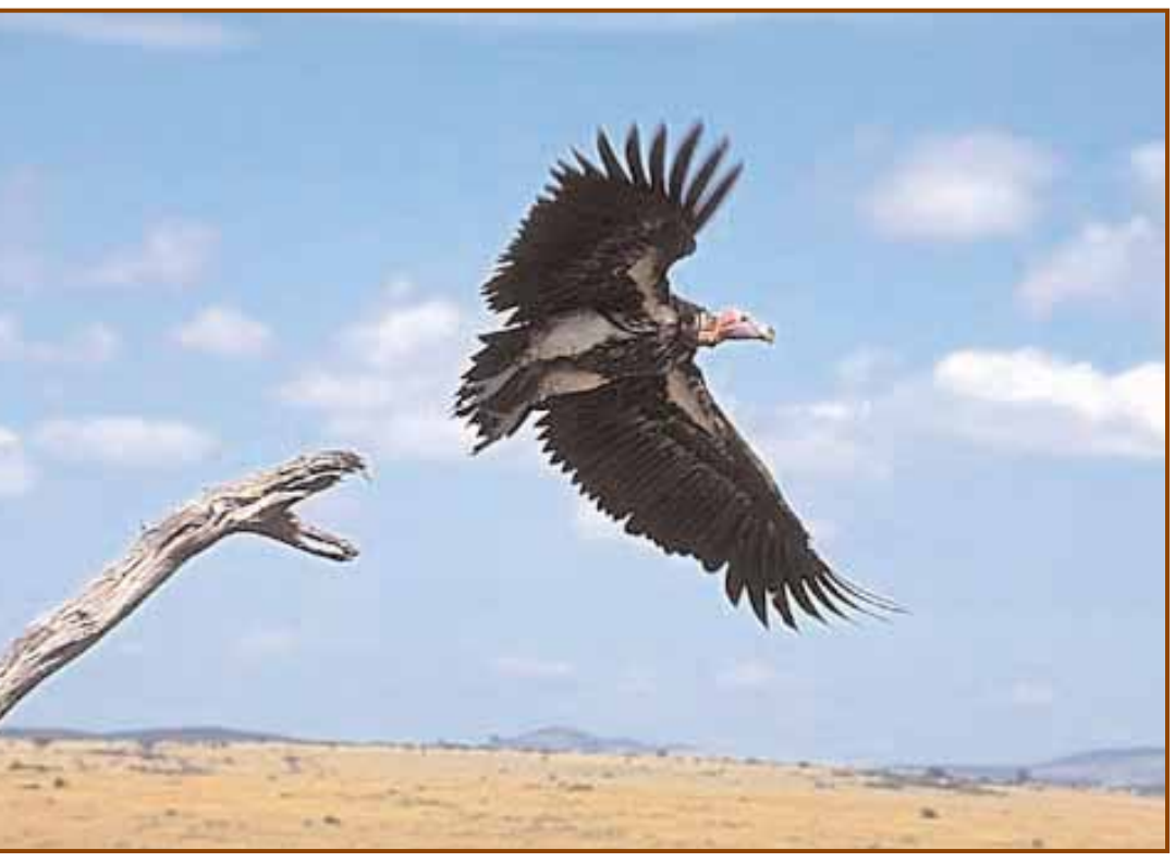
The Lappet-faced Vulture (Torgos tracheliotus) is one of over 500 species of birds that one can observe during a three-week trip in Kenya. If impoverished local people do not have financial incentives to protect bird habitat, however, such trip lists may soon be history. Masai Mara Reserve, Kenya; July 1998.

needs to be done to increase the financial contribution of birding to local communities.