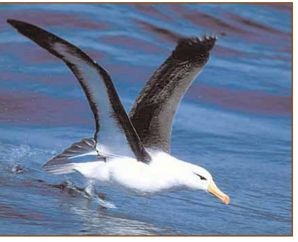
Pelagic birding tours can be an alternative source of income to many fishermen that have been hard-hit by disappearing fish stocks. This Black-browed Albatross was photographed during a pelagic trip off Cape Town. Cape Town, South Africa; August 1998.

sult in the preservation of many areas without official protection. Birds do not pay attention to boundaries, and many species can only be observed outside officially protected areas—at